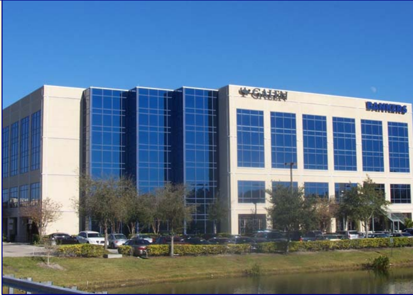
ROOSEVELT III BUILDING

11101 Roosevelt Blvd, St. Petersburg, Florida 33716