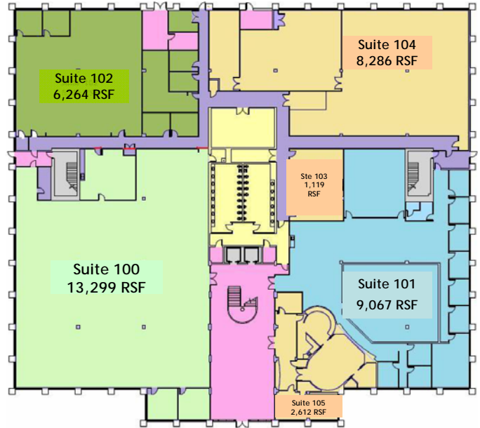
Multi - Tenant Layout

The 40,647 RSF space is currently one large suite which can be subdivided as follows: