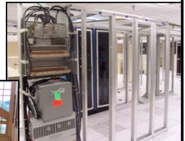
SERVER ROOM WITH UPS & LIEBERT SYSTEMS