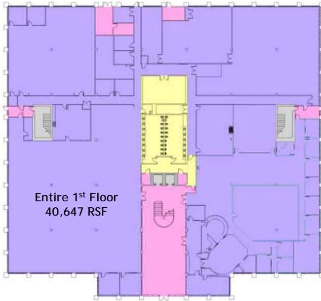
Single Tenant Layout