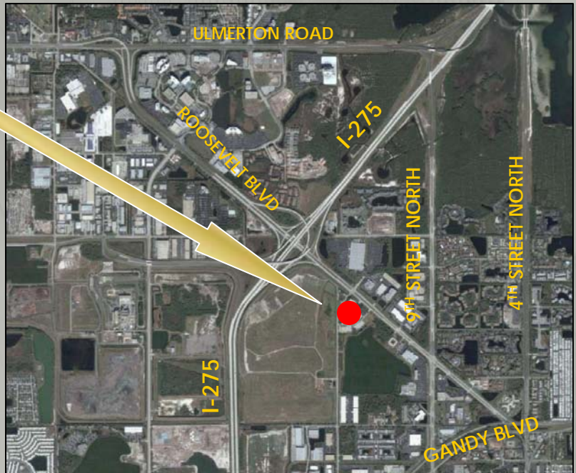
LOCATED ON ROOSEVELT BLVD IN, MID-PINELLAS COUNTY

Located near Carillon Park, which includes Publix, Courtside Grille, Hilton Hotel, St. Anthony's Wellness Center, and Gingerbread School (child care facility).