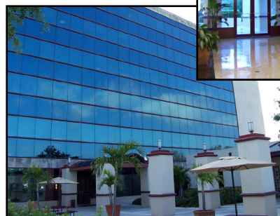
Main Entrance & Outdoor Seating

ECHELON Echelon Real Estate Services, LLC 235 Third Street S, Suite 300 St. Petersburg, Florida 33701