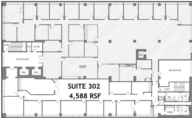
SUITE 302 - 4,588 RSF