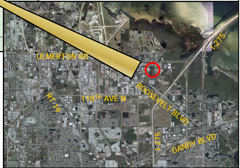
LOCATED IN CARILLON PARK, MID-PINELLAS COUNTY